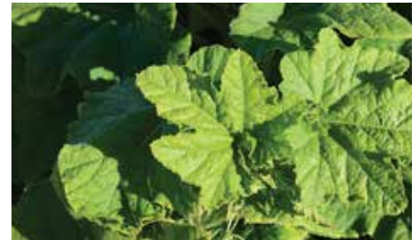
Zorvec Enicade at label rate (350 mL/ha)